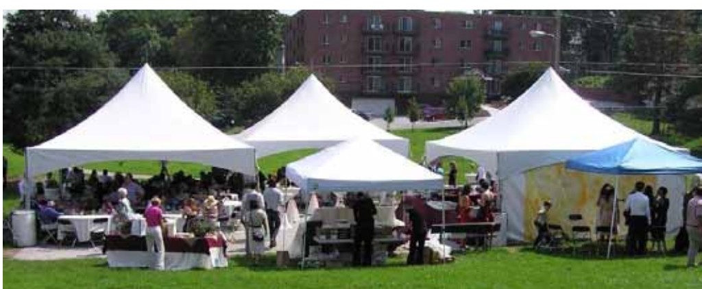
Dana and Stuart's Gifford Park Wedding in 2009

I couldn't help myself, I went digging back through old photos to find these gems of Dana & Stuart's wedding day September 2009 in Gifford Park! I remember I was super excited and