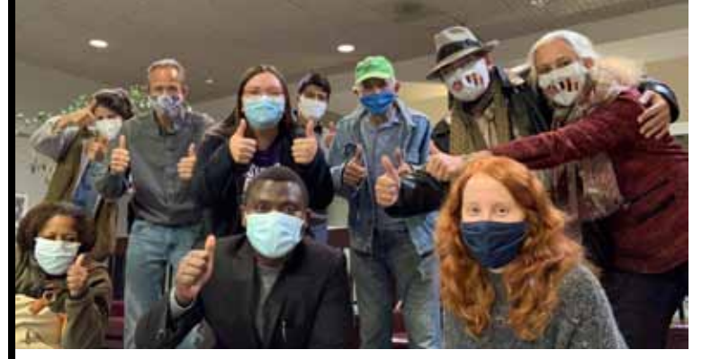
Supporters of the Yates Illuminates proposal celebrate!

After over a year of steady advocacy, Monday, November 16, 2020, we had only a few minutes, not even hours let alone days, to celebrate. It's true, as you must have heard. With a six to one vote the Omaha Public Schools Board of Education voted to sell Yates-the former elementary school at 3262 Davenport St—back to the community. It was the second time in five+ years that we had to "Save Yates." The first time it was from the wrecking ball. This time it took a year+ of steady work, of dreaming big and selling our big dreams to everyone, of strategizing and connecting partners and resources and committed community-oriented local organizations, of advocacy for the community and of organizing our Omaha-wide effort, of fund-raising and of supporting an Omaha-wide campaign to convince all of our OPS Board of Education elected officials of our reputation and how that will impact the viability of our project. By February alone-when we had to persuade OPS administration a viable plan was in the makingwe had spent over 1500 hours of volunteer work organizing. Public school parents and home schooling parents, neighbors, neighborhood associations and alliances across town, non-profits large and small, foundations and educational institutions on both sides