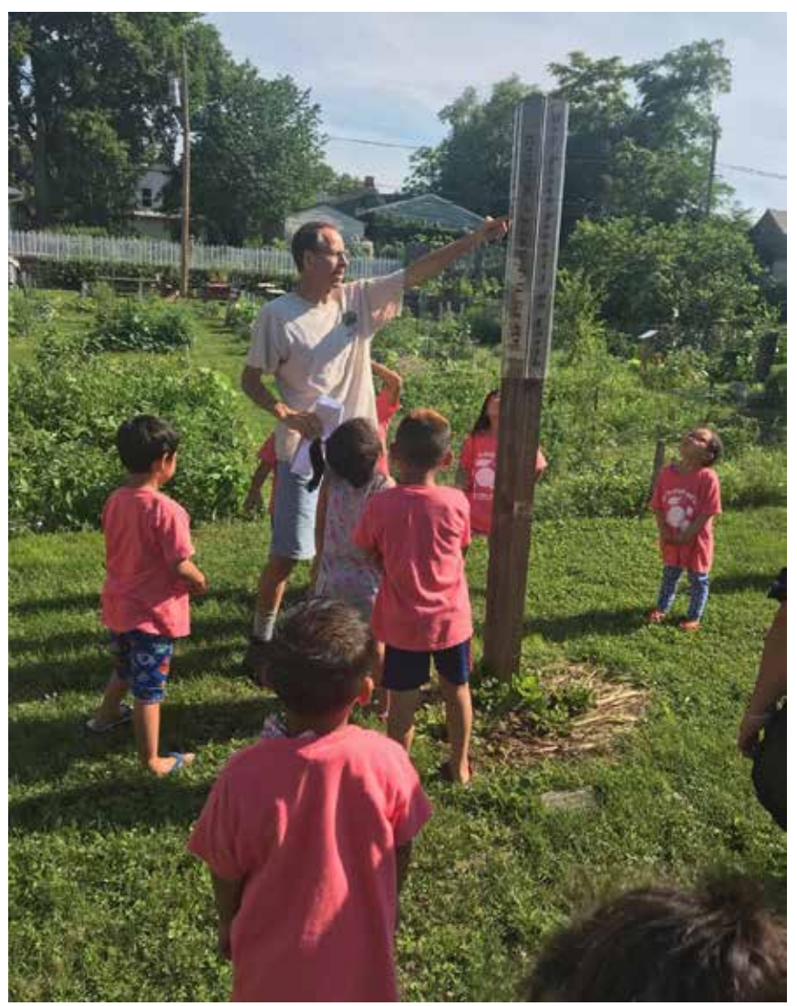
2,772 students who are refugees coming from 15 different countries. This is 5.5% of the schools' enrollments. Yates Pre-K students learning about the peace pole while on a field trip at the community garden. The peace pole says "May Peace Prevail on Earth" in six different languages, representing the diversity of our neighborhood.

The Yates programming will start on Monday, August 20th.