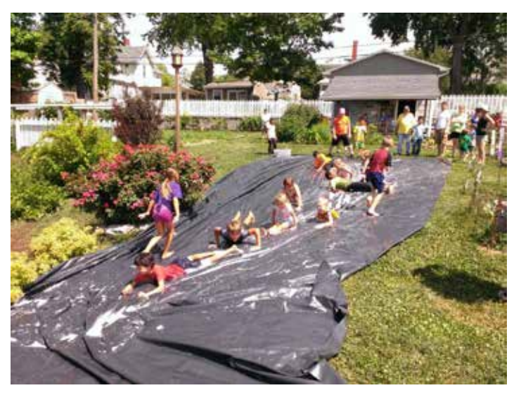
Big Muddy Urban Farm Breaking New Ground Event Held July 21st