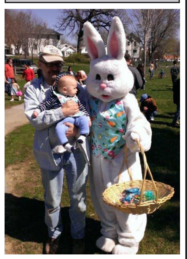
continued on page 5

7:00 pm CHI Health-Creighton University Medical Center Morrison Seminar Room