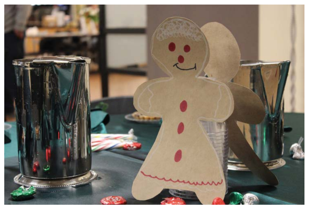
Gingerbread people by Dana Carlton-Flint decorated our tables.