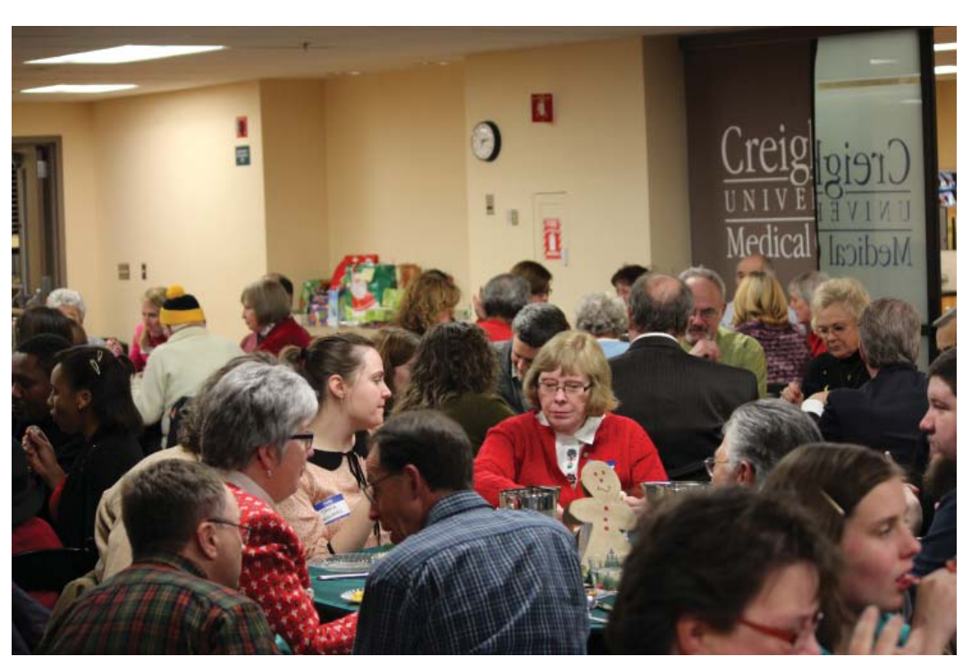
Neighborhood\ residents\ and\ friends\ enjoy\ dinner\ and\ conversation.