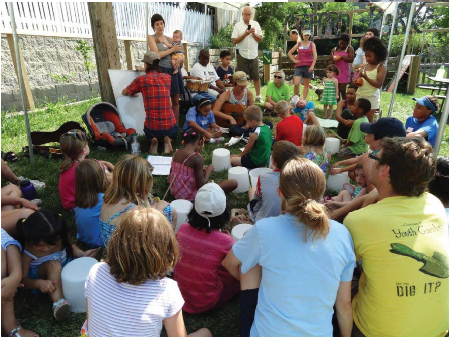
(left) Week 9 - Sound of Music