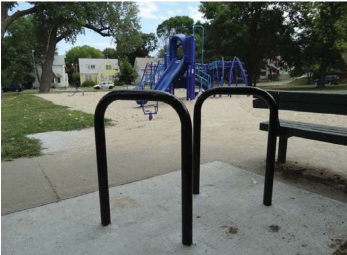
New bike racks installed at Gifford Park playground with new benches to be installed nearby soon.

A new business getting ready to open, a neighbor taking care of a garden, improvements in the park - its the little things that make a neighborhood great. Here are few scenes from around the neighborhood.