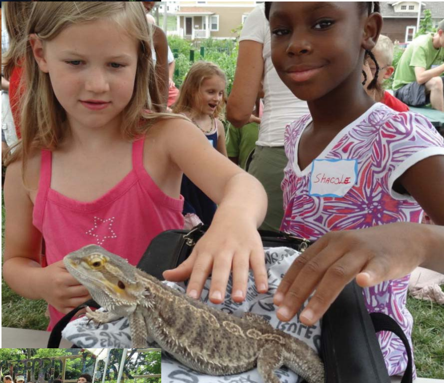
(left) Week 8 - Reptiles