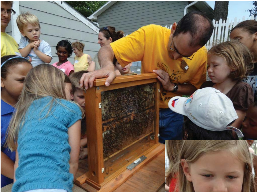
(left) Week 6 - Beekeeping