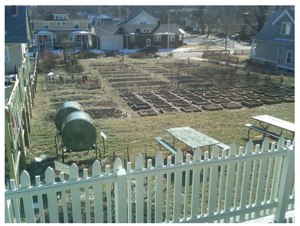
Gifford Park Community Garden in February 2012. Gardeners neighborhood-wide anxiously wait for the ground to thaw so they can get their hands dirty!