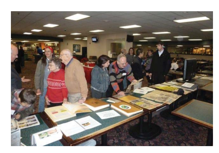
Neighbors learn and reminisce about the history of our neighborhood.