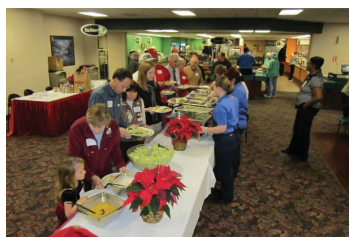
Sodexho once again graciously provided a holiday buffet with all of the trimmings.