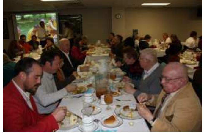
GPNA members enjoy the delicious meal provided by CUMC and Sodexho. Special thanks to all the employees who helped prepare, serve, and clean up after the banquet.