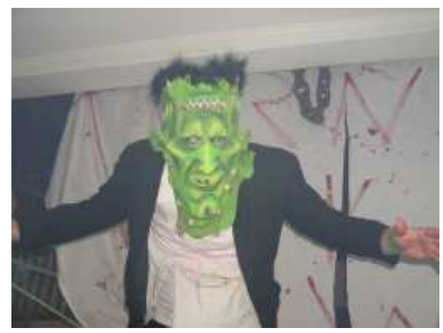
The ghouls were out in force at the GPNA-PKA Annual Haunted House this year. For a recap of the event, please see page 4.

Next General Meeting Thursday, November 12 7:00 P.M.