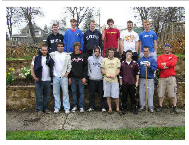
Members of the PKA Fraternity from Creighton University helped mulch flower beds and prepare 55 youth garden plots at the Community Garden on April 18th - even in the rain!