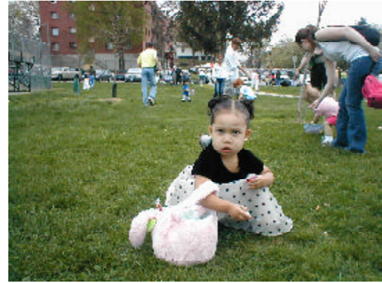
As you can see from this picture, Easter egg hunting is serious business.