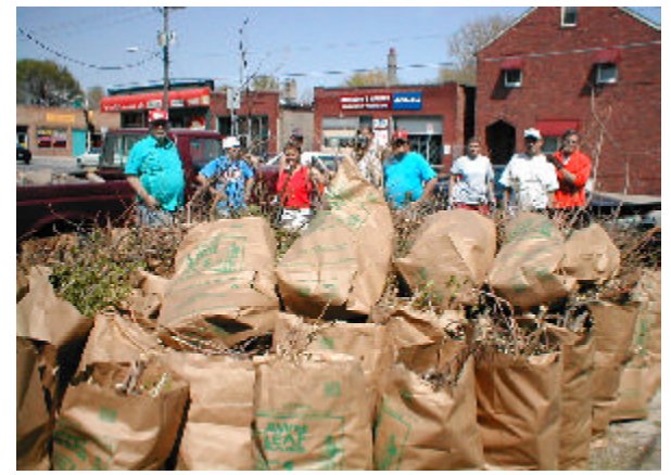
Volunteers look over the bags of leaves, branches, and other debris that was cleaned up in the business district on Earth Day. A horseshoe pit will be located behind the lot between J'N'J Grocery and the California Bar.